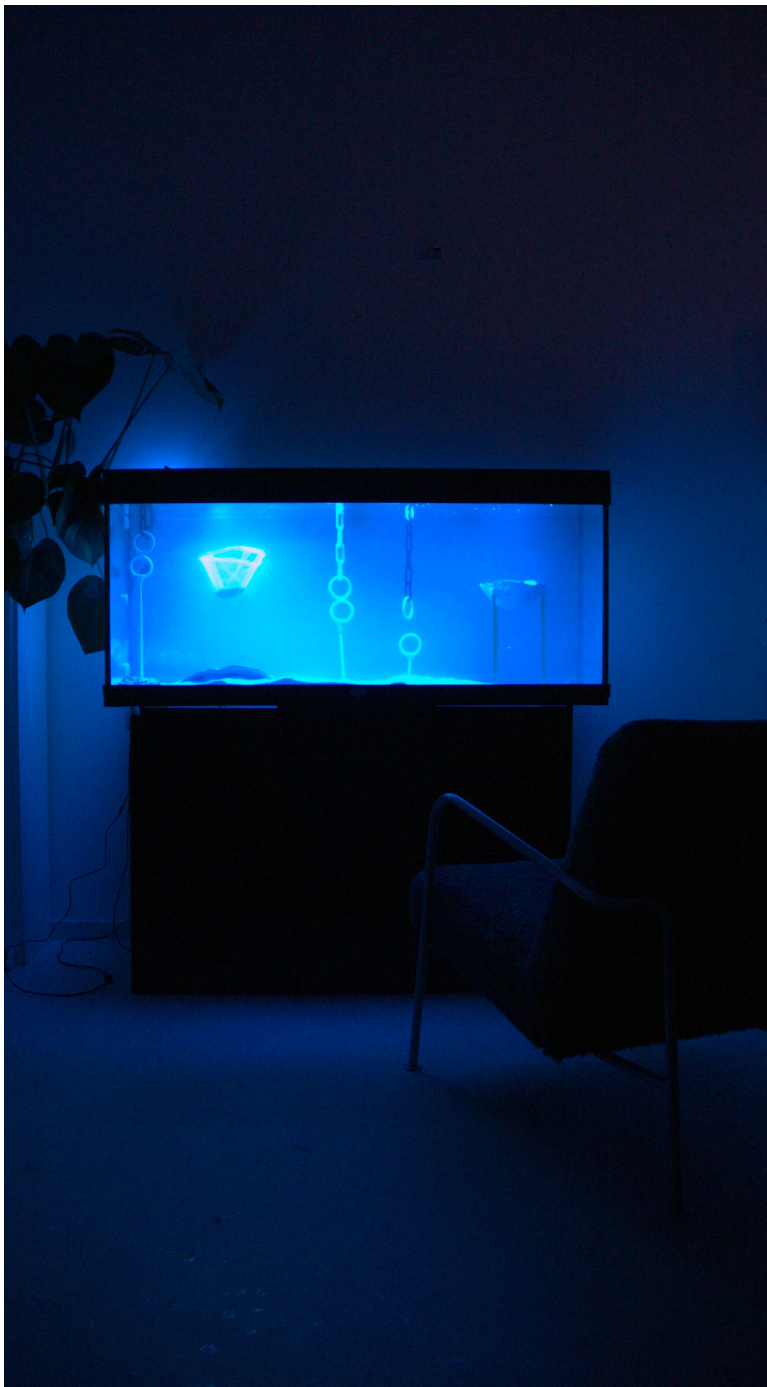
“Shrimp Love“, Installation, 2021