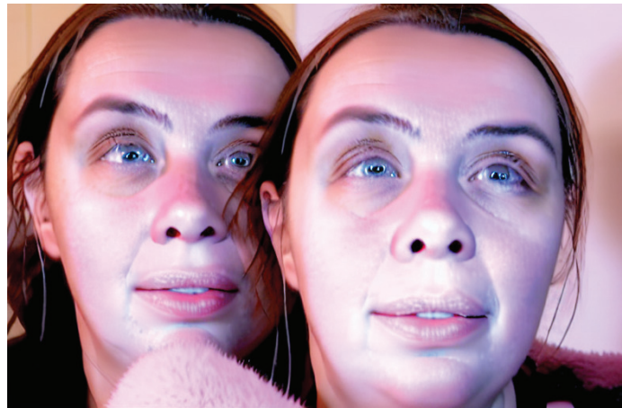
Still from the Fanfiction "Krista falls in love with another woman".