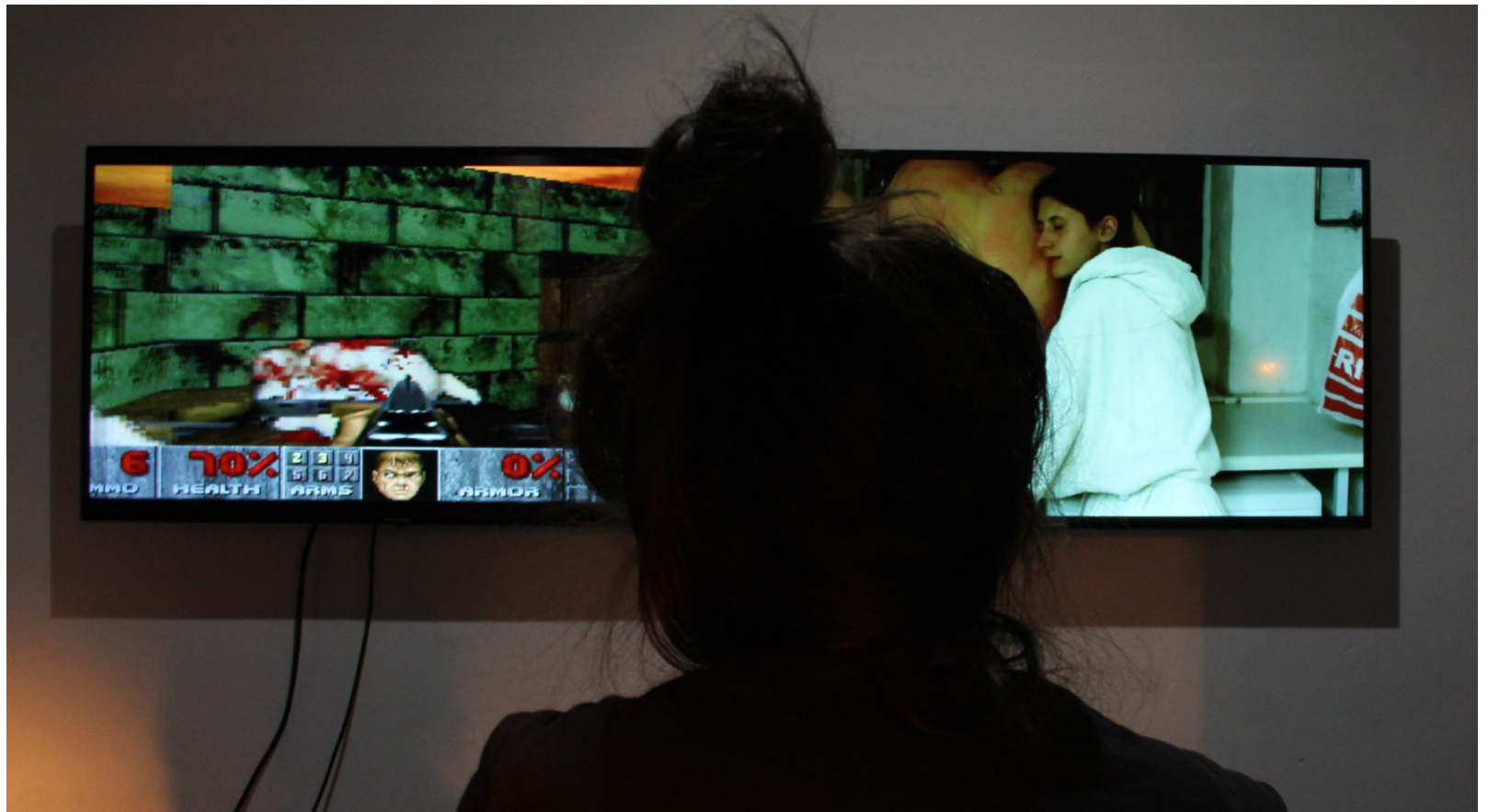
“HORST”, Installation at TEC ART Rotterdam, 2022

This interactive installation with five video works questions right-wing images of masculinity.