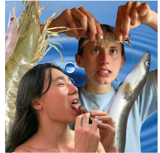
Anguille Vannamei Duo Portrait, 2022

To date, the project has been supported by Sonic Acts Amsterdam and Stimulerend Fonds .