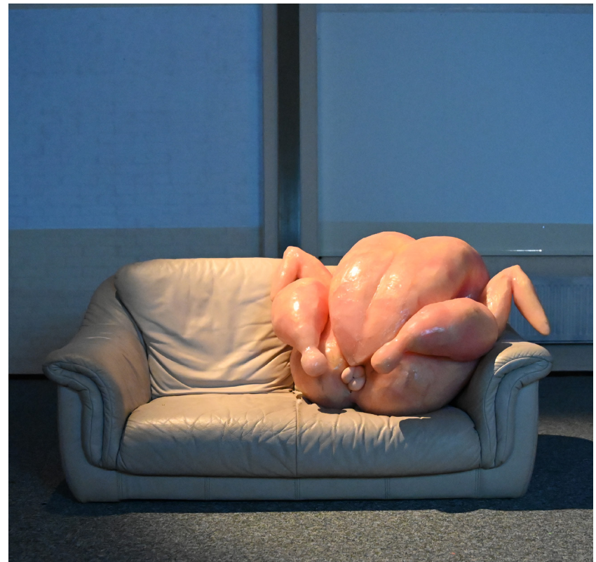
"HORST", Installation at Museum of the Future Enschede, 2022

MyChick, a 1x1m chicken sculpture, gives expression to this idea. It serves Horst as a sex toy and symbolises the objectification of meat. Who it belongs to is unimportant, the main thing is that it is tasty and sexy. The soft silicone resembles conventional sex dolls, while the form remains deliberately ambivalent between roast chicken and woman. Three masturbators are positioned at the neck, vagina and anus.