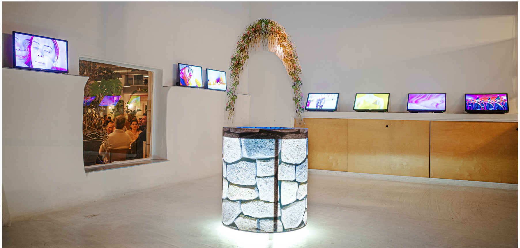
“The Fan Fiction Wishing Well”, Installation at Meldkamer for Transitions Festival Maastricht, 2023

An interactive video installation questions the future of film through AI-generated moving images.