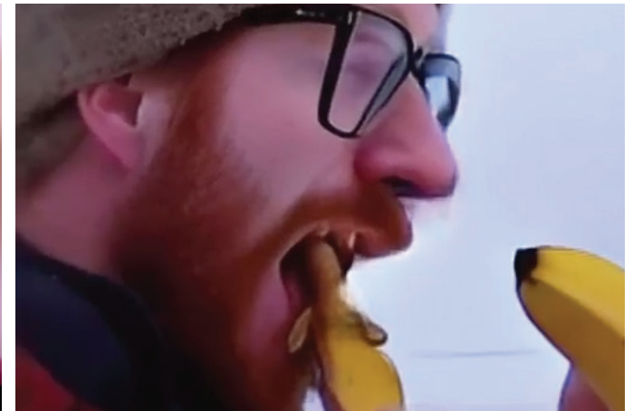
Still from the Fanfiction "Michiel eats a banana in the Arctic".

For Transitions Maastricht, a festival for experimental films, the audience was invited to come up with a fan fiction (alternative narrative) of a film shown at the festival. Via a sticker with a QR code distributed throughout the festival, visitors were directed to a website where the narrative could be recorded via voice message. The next day, a video interpretation of the previous day's stories was shown in the Meldkamer.